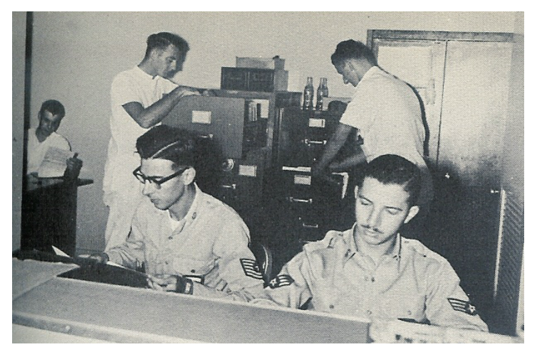
Keeping the records straight in the flight surgeon's office, England AFB, LA, 1955.